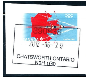
Figure 11

Canada Post issued a stamp showing the Lancaster bomber as part of a series showing military aircraft. Unitrade #874 was issued on November 10 th 1980 and is in a se-tenant pair with the Voodoo from the 1950-60's. The building of the Lancaster was completed in