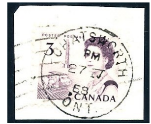
Figure 10

saw an opening for Post Master in Walters Falls and became the Post Mistress there. That is how they met each other and the rest is history, so to speak. The Chatsworth Post Office is still going strong with its own cancel.