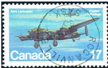
Figure 8 From the collection of JCL

Alas, the Great War was not the end of world wars. The display also included stamps and covers showing the Second World War. An elderly gentleman came