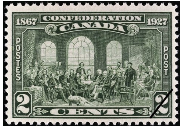
Figure 14 In honour of the Canada 150, Unitrade # 142 issued to honour the 60th anniversary of Confederation.

When you have a chance, why not visit the club web site at www.owensoundstampclub.org . Feedback is always important to keeping this means of connecting up to date. The only way to end a newsletter is with another picture of our common obsession, stamp collecting!