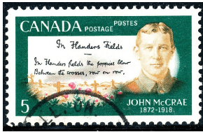
Figure 7 Unitrade # 487.