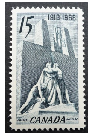
Figure 6 The Vimy Ridge monument from the editors collection.

The name Vimy Ridge has been widely reported in Canadian history. Several sources suggest this battle was the forming of Canada as a nation because all the Canadian troops were organized and fought together and led to the victory at the ridge for the army. Vimy Ridge was simply a smaller part of a much greater battle plan called the Arras Offensive. Both the French and British armies had attacked and failed to win Vimy Ridge, prior to 1917. The success of the Canadian Corp led to the ceding by France of about 100 acres of battlefield to Canada to construct a memorial of the battle. Unitrade #486 shows the monument built on the Ridge.