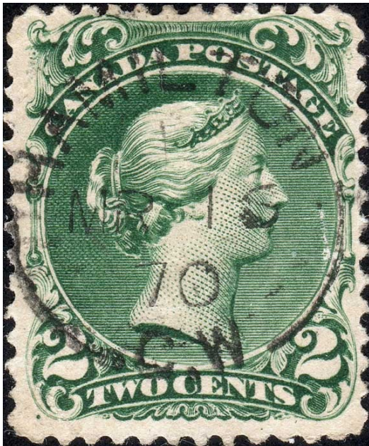
Figure 13 Unitrade # 32 as copied from the VGG Foundation website.

Phil Visser (519) 376-6760 554 9 th Street A East Owen Sound, ON, N4K 2C0 visserps@bell.net