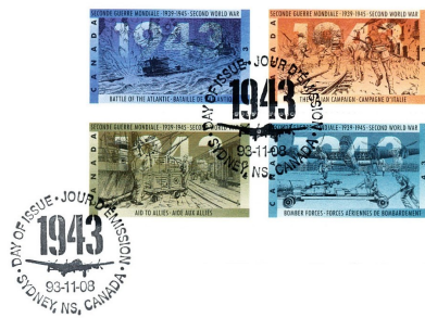
Figure 12 The Lancaster bomber is featured as part of #1504 (stamp on the bottom right hand corner) as well as in the cancellation of the FDC. From the collection of JCL