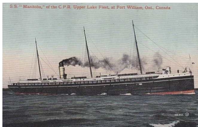
Figure 3 This is a copy of a Google Image when searching for the SS Manitoba

A week ago I was at an event at the Owen Sound Rail and Marine Museum by the harbour. The invitation was to see the first time lighting of recently added lights to the masts located on the east side of the harbour. What I learned was that the masts represented those that were on the SS Manitoba, a ship that was built in Owen Sound by the Polson Iron Works. To complete the building of the ship, hundreds of Scottish iron workers immigrated to Canada to build the ship. Apparently there were no local trades people available to do this project, not even in the United States.